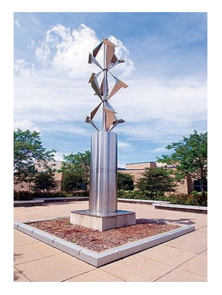
"Celebration of Peace"

fact that her classes were taught in the morning, when mostly women could attend. And she felt that women had a better feel for sculpture than men.