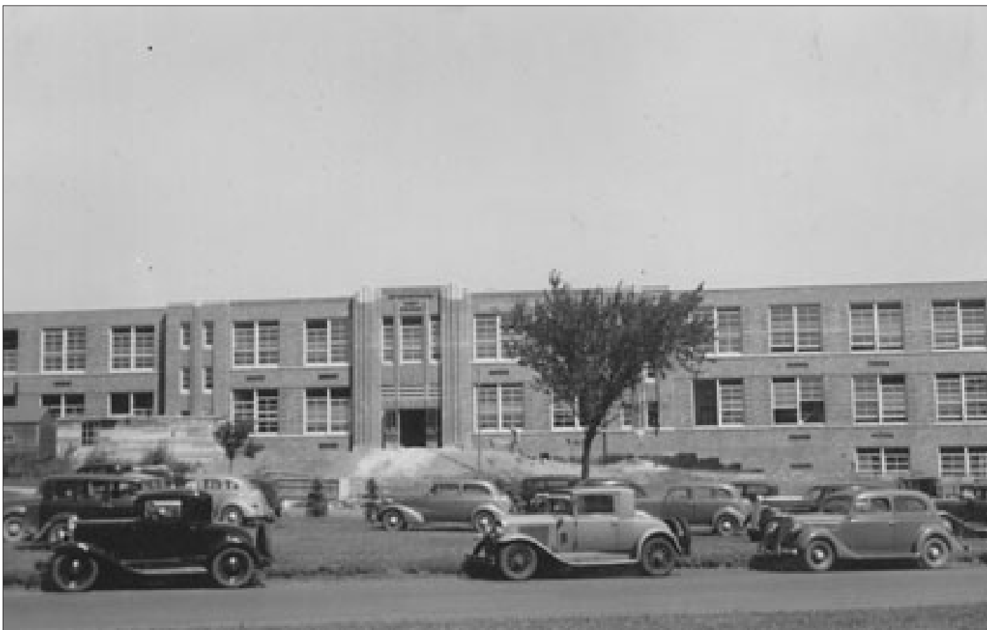
(Top) Central in 1938 (Below) Central, conceptual drawing of East Wing as published in The Echo , November 1951.