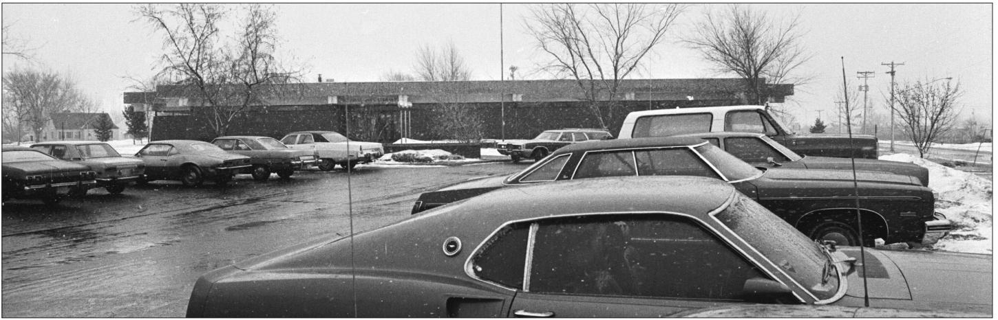
St. Louis Park Library